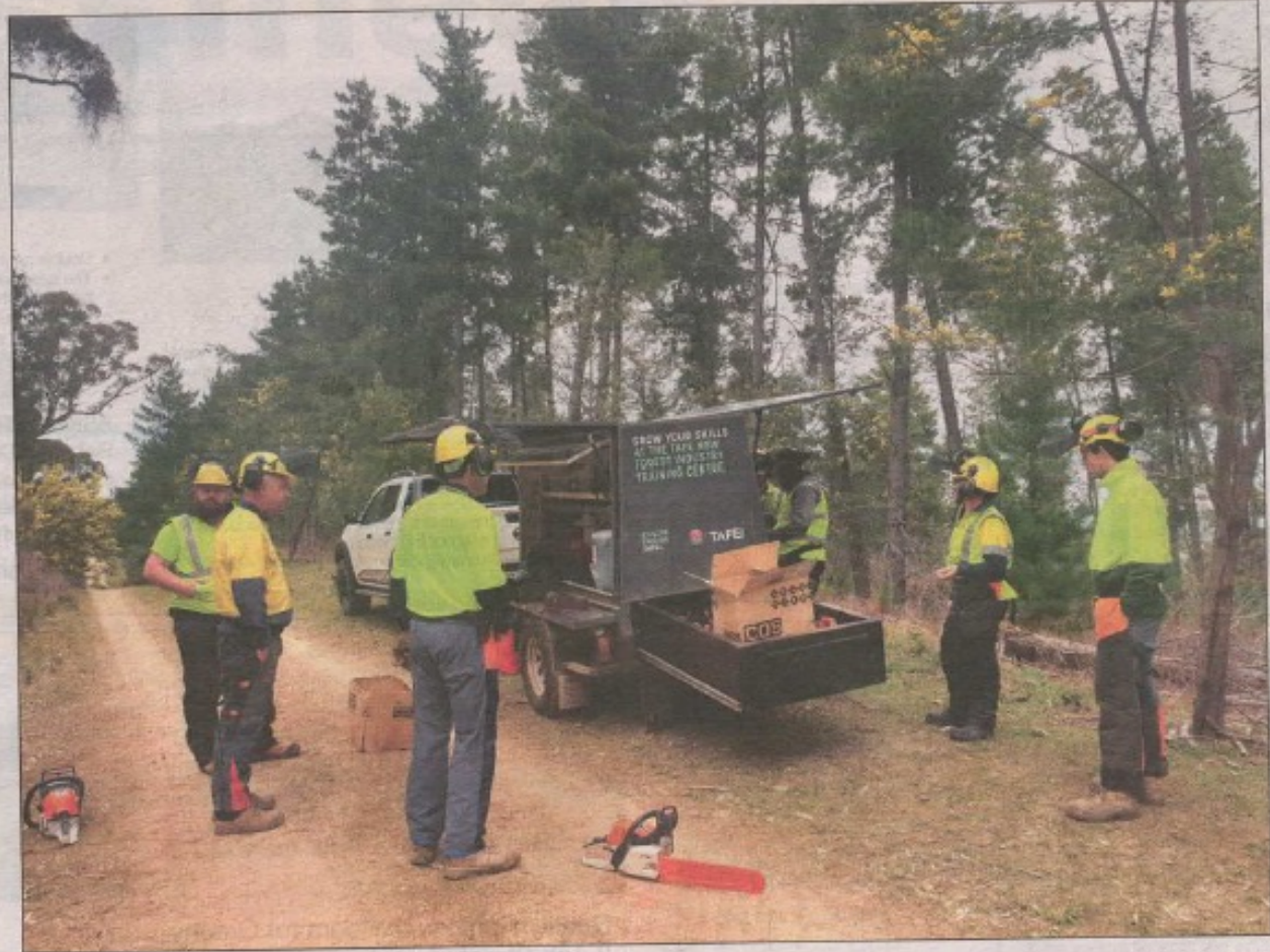
A group of locals prepares for chainsaw training as part of a unique training partnership between TAFE NSW and ForestWorks.