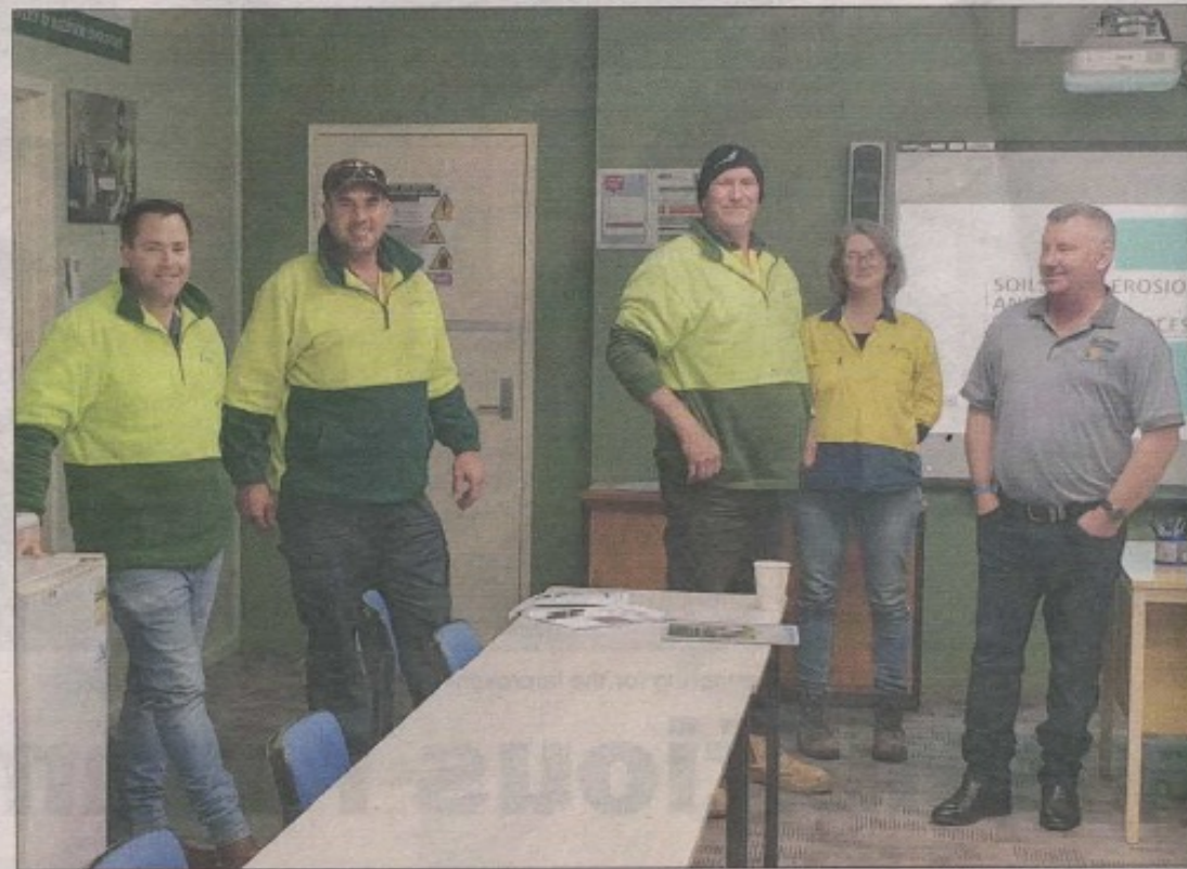
Above and below: Timber workers involved in skill training.

Funding for Snowy Valley Skills Development Services was achieved from a successful Bushfire Local Economic Recovery (BLER) Fund application by ForestWorks. The BLER Fund is jointly funded by the Australian and NSW Governments.